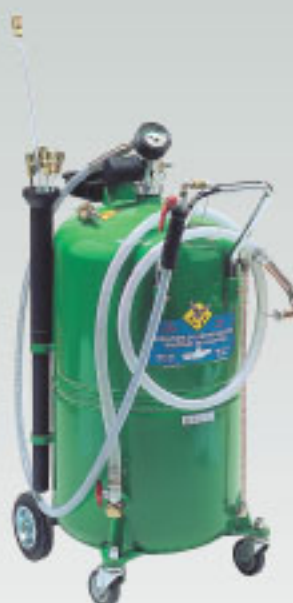
Art. 43790 90lt