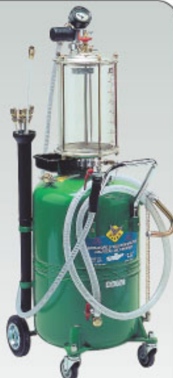
Art. 43765 65lt

Ideal for quickly changing (by probe) the oil of boat motors .