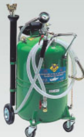
Art. 43760 65lt