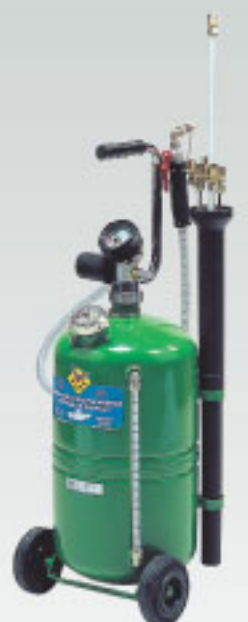
Art. 43724 24lt

with SUCTION TUBE 4 m connections for INBOARD and OUTBOARD