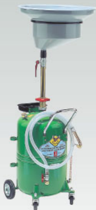
Art. 42160 65lt