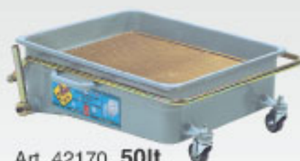
Art. 42170 50lt