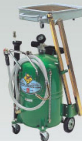
Art. 42164 65lt