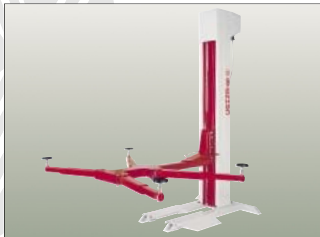
Mistral 20 S